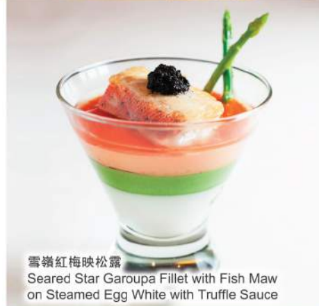
雪嶺紅梅映松露 Seared Star Garoupa Fillet with Fish Maw on Steamed Egg White with Truffle Sauce

City Garden Hotel, 9 City Garden Road, North Point (Fortress Hill MTR station Exit B) 北角城市花園道9號 城市花園酒店 (炮台山港鐵站B出口)